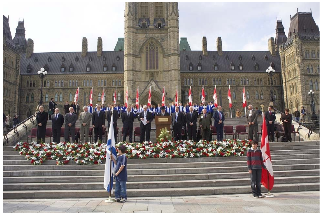
The National Holocaust Memorial Day Ceremony on Parliament Hill, Ottawa, Canada, organized by the Canadian Society for Yad Vashem, 2 May 2008.