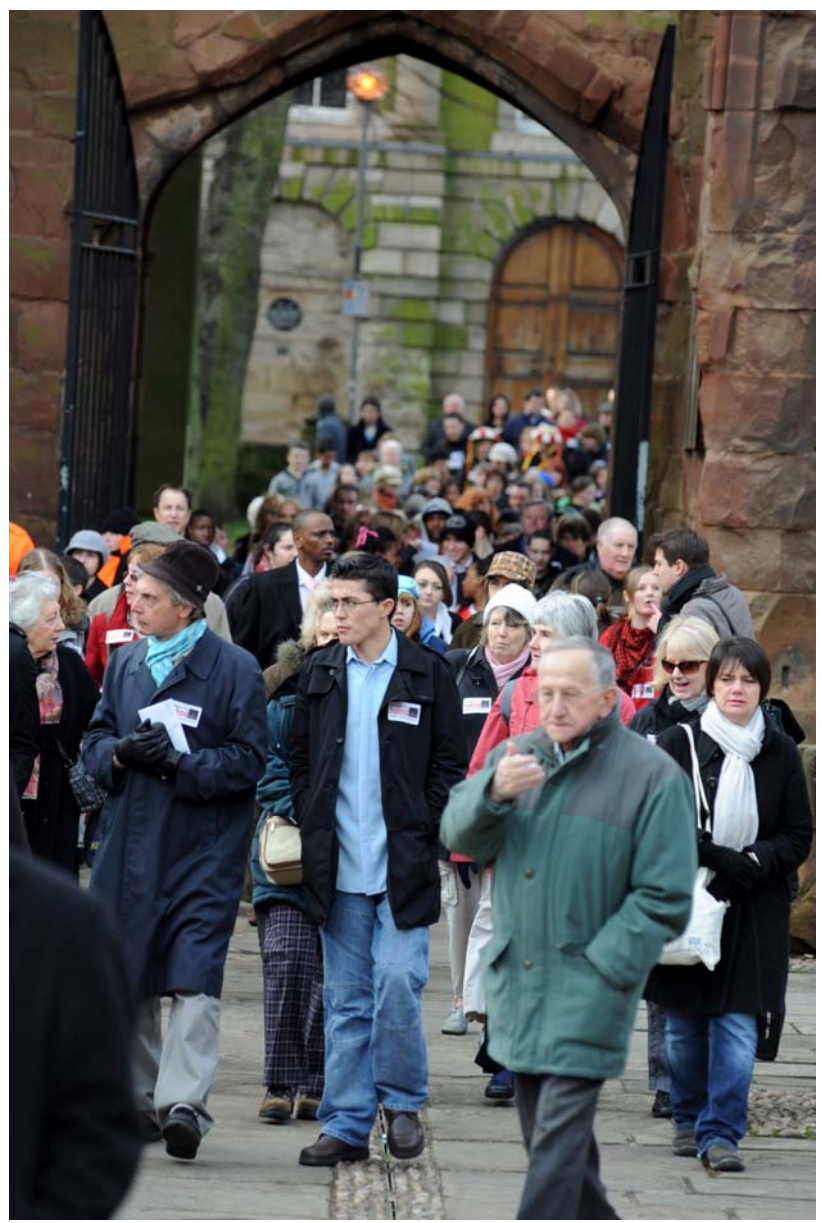
March in Coventry, United Kingdom, 27 January 2009.

The HMDT has contracted a media agency to generate media interest and publicity for Holocaust Memorial Day. As a new initiative in advance of Holocaust Memorial Day 2010, social media were utilized and the HMDT now has a presence on Facebook and Twitter.