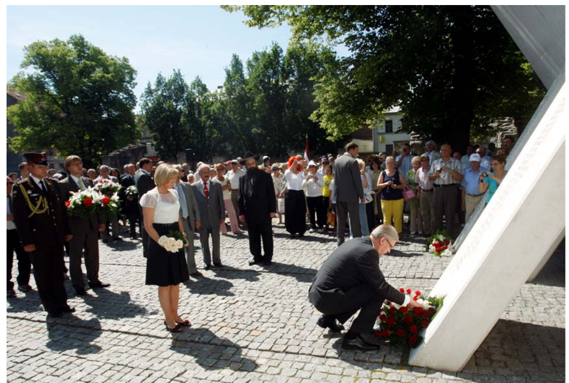
The President of the Republic of Latvia, Valdis Zatlers, laying a wreath at the monument in Riga to the rescuers of Jews, 3 July 2009.