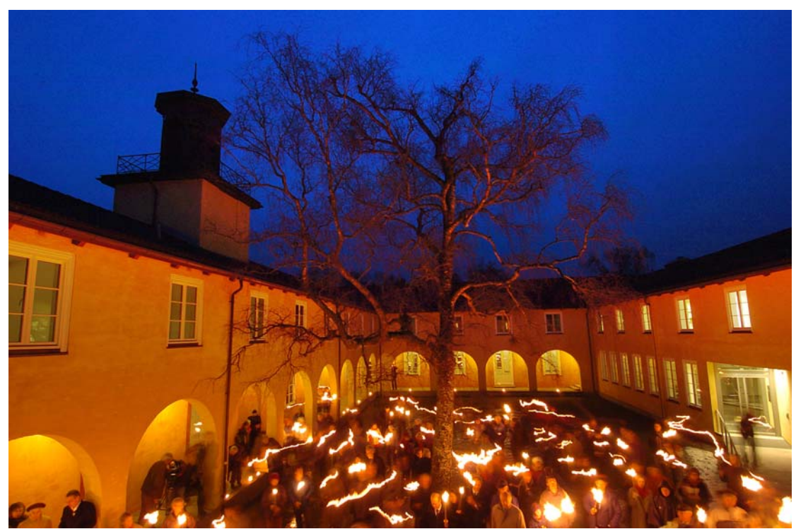
Holocaust Memorial Day commemoration at the Falstad Memorial and Human Rights Centre, formerly SS Camp Falstad (1941-45), Norway, 27 January 2009.