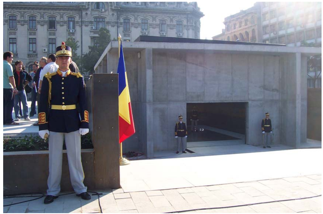
Presidential inauguration of the Holocaust Monument in Bucharest, Romania, 8 October 2009.

Information provided by the Romanian Delegation to the Task Force for International Co-operation on Holocaust Education Remembrance and Research in a communication, dated 21 August 2009.