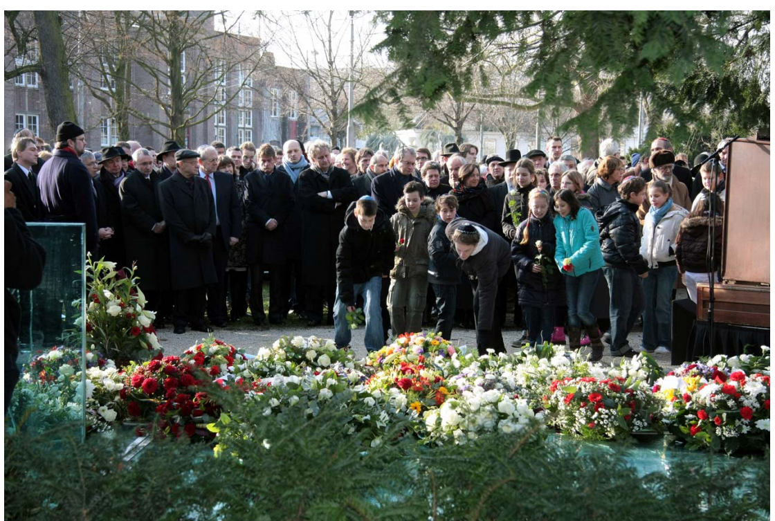
Auschwitz commemoration, Auschwitz Monument, Wertheimpark, Amsterdam, 27 January 2009.

The commemoration<sup>22</sup> preceding 27 January takes place at the Auschwitz Monument in Wertheim Park in Amsterdam and is open to everyone. Wreaths are laid, Kaddish is recited and speeches are given. At least one Dutch Government minister is present at the event, as well as the chairpersons of both houses of parliament.