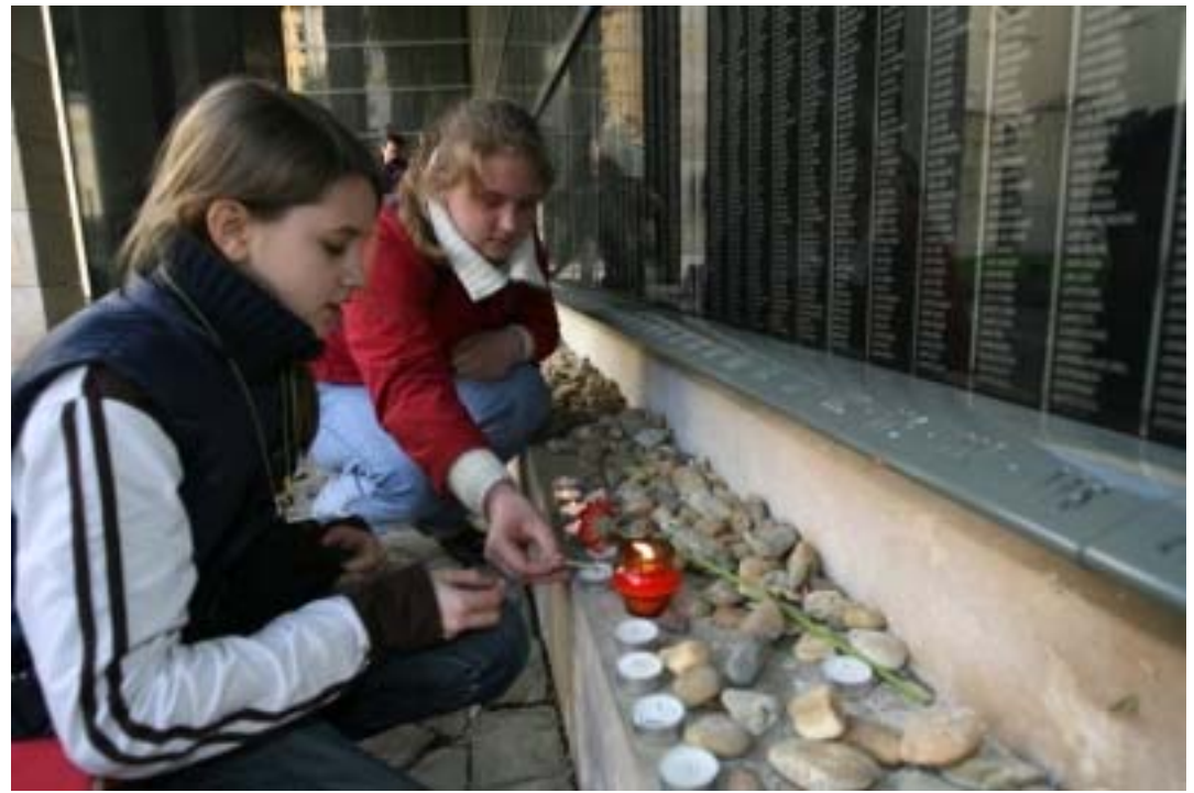
Hungarian Holocaust Memorial Day at the Hungarian Holocaust Memorial Center, Budapest, 16 April 2008.

Every year the entire Cabinet, the President, the members of the Supreme Court and Members of the National Assembly from all parties attend the commemorative event held in the National Assembly.