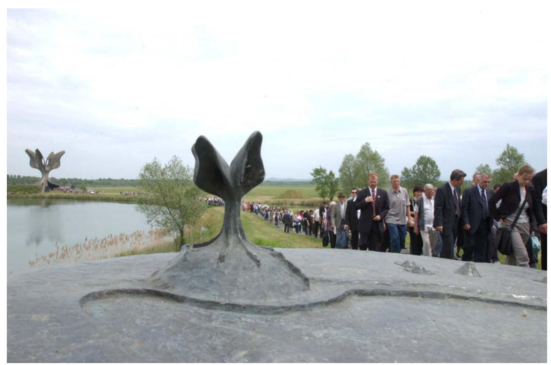
Jasenovać Memorial site, Croatia, 27 January 2008.

Information provided by the Croatian Delegation to the Task Force for International Co-operation on Holocaust Education Remembrance and Research in a communication dated 22 September 2009.