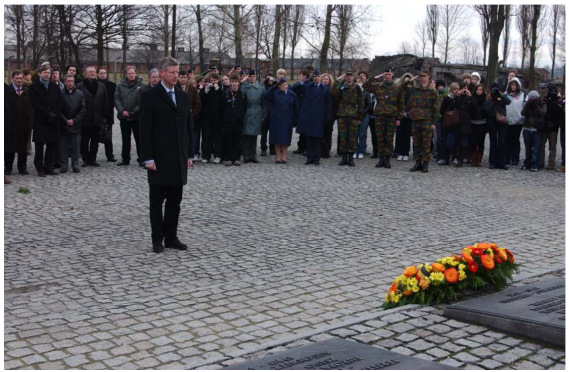
Belgian Minister of Defence Pieter De Crem at a Holocaust commemoration ceremony, Auschwitz, 27 January 2008.

In 2007, the main official event was held on 8 May, coinciding with the presentation and publication of the official report on the actions of the Belgian authorities during World War II. On that day, the Prime Minister and the Belgian Minister of Defence unveiled a commemorative plaque in the centre of Brussels honouring the 1,443 Belgians that have been recognized by Yad Vashem as "Righteous among the Nations". The 27 January event was arranged by Jewish organizations and took place at the national monument in Anderlecht, with a number of high-level government officials in attendance.