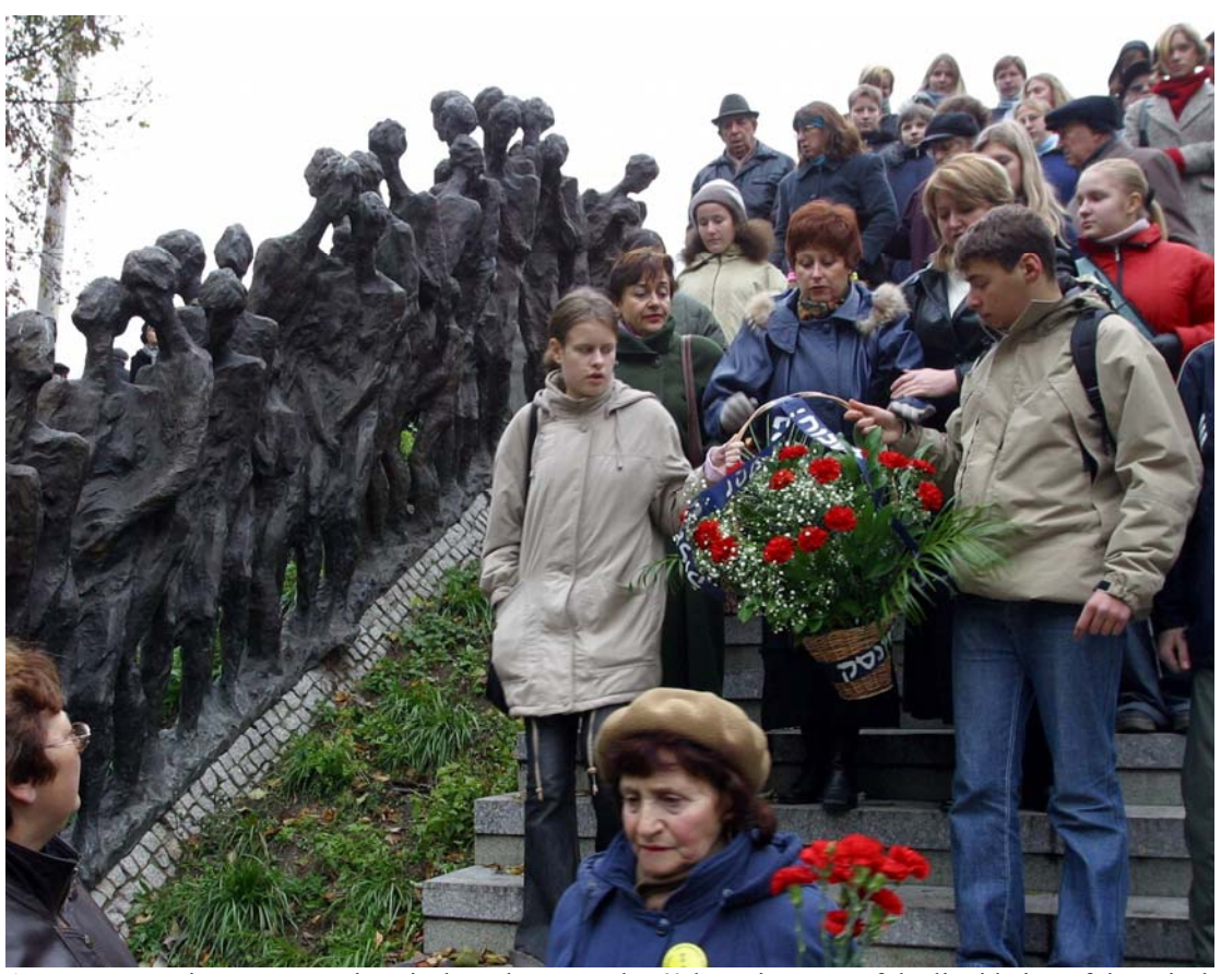
A commemorative ceremony in Minsk, Belarus, on the 60th anniversary of the liquidation of the Minsk ghetto, 21 October 2003.

Information provided by the Permanent Delegation of the Republic of Belarus to the OSCE in a communication dated 12 October 2009.