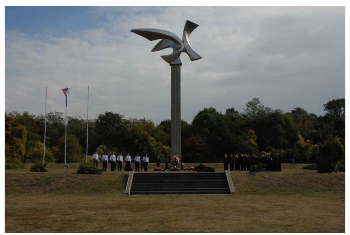
An official state ceremony held on 3 October 2008 in Jajinci, near Belgrade, Serbia: Numerous Serbian actors, musicians and choirs participated in the artistic part of the ceremony.

Interest among the Serbian population about the Holocaust is increasing year by year. Numerous television and radio programmes, as well as educational, scientific and artistic projects have been organized throughout Serbia.